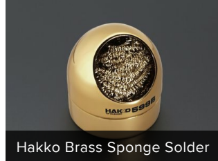
Hakko Brass Sponge Solder