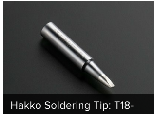
Hakko Soldering Tip: T18-