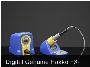
Digital Genuine Hakko FX-