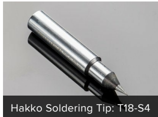
Hakko Soldering Tip: T18-S4