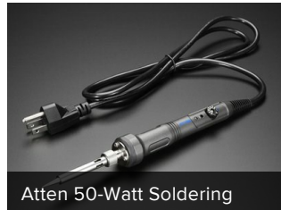
Atten 50-Watt Soldering