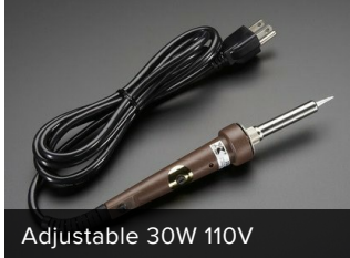
Adjustable 30W 110V