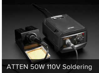
ATTEN 50W 110V Soldering