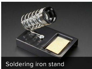
Soldering iron stand