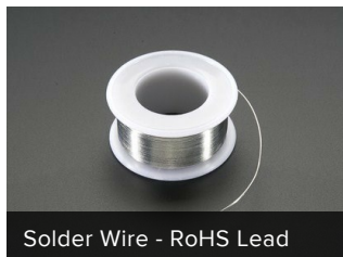
Solder Wire - RoHS Lead